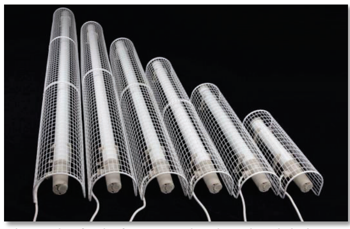
The complete family of AIANO guards and Dimplex tubular heaters

AIANO wire guards are manufactured in the UK from British and European Union steel.