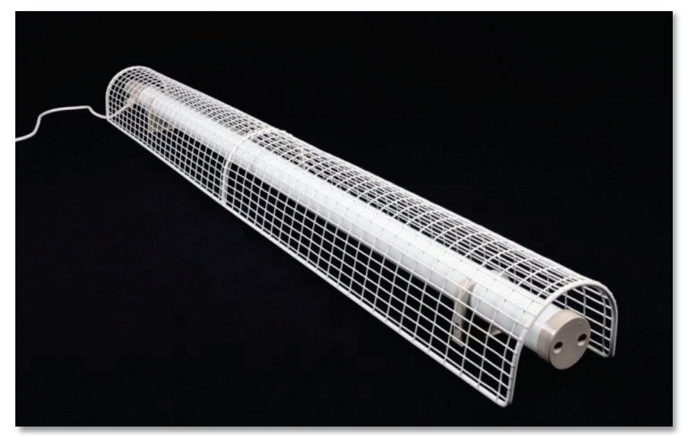
AIANO STG41 tubular heater guard for the new Dimplex ECOT4FT tubular heater with thermostat