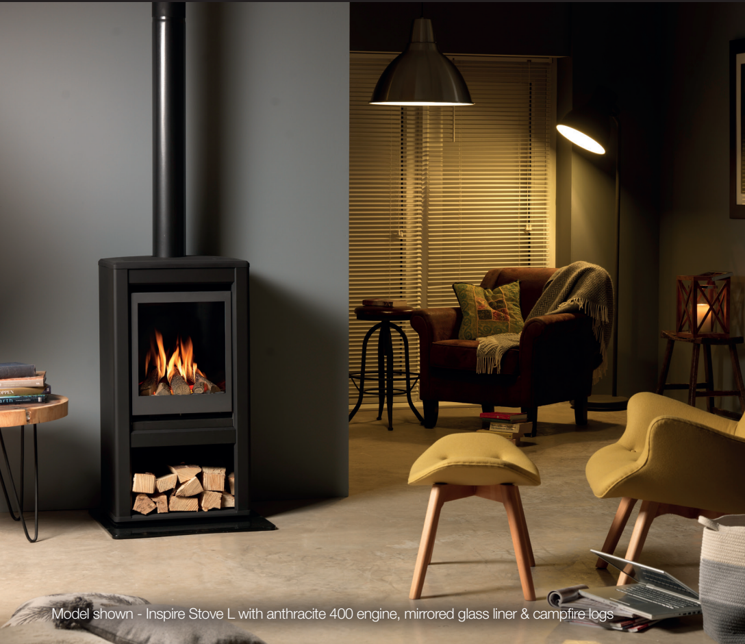
Model shown - Inspire Stove L with anthracite 400 engine, mirrored glass liner & campfire logs