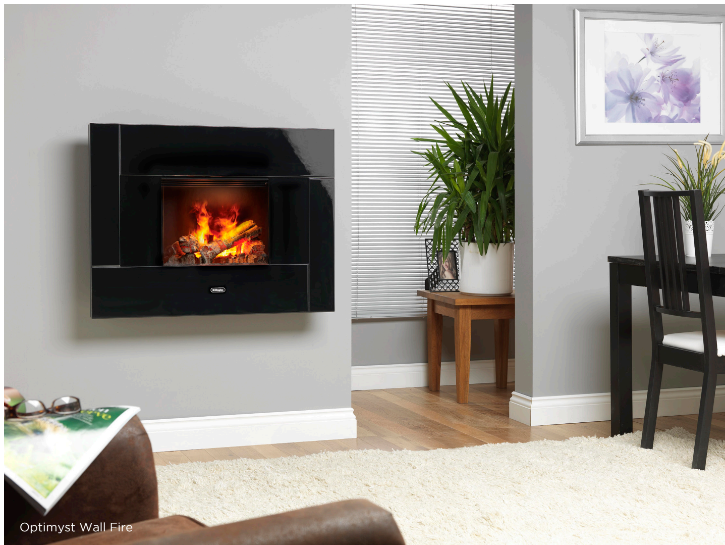
Optimyst Wall Fire

This wall mounted fire stylishly frames a dazzling open front, maintaining stunning visuals while giving you an amazingly thin depth for minimal intrusion. Easily controlled by the easy to use remote, you will also experience the patented Optimyst flame and smoke effects.